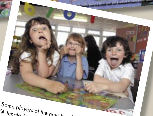
Some players of the new Family Learning board game 'A Jungle Adventure' mimic the animal characters.