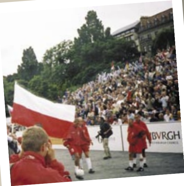
Homeless World Cup 2005 in Princes Street Gardens. Italy beat Poland to win the cup, Scotland came fourth.